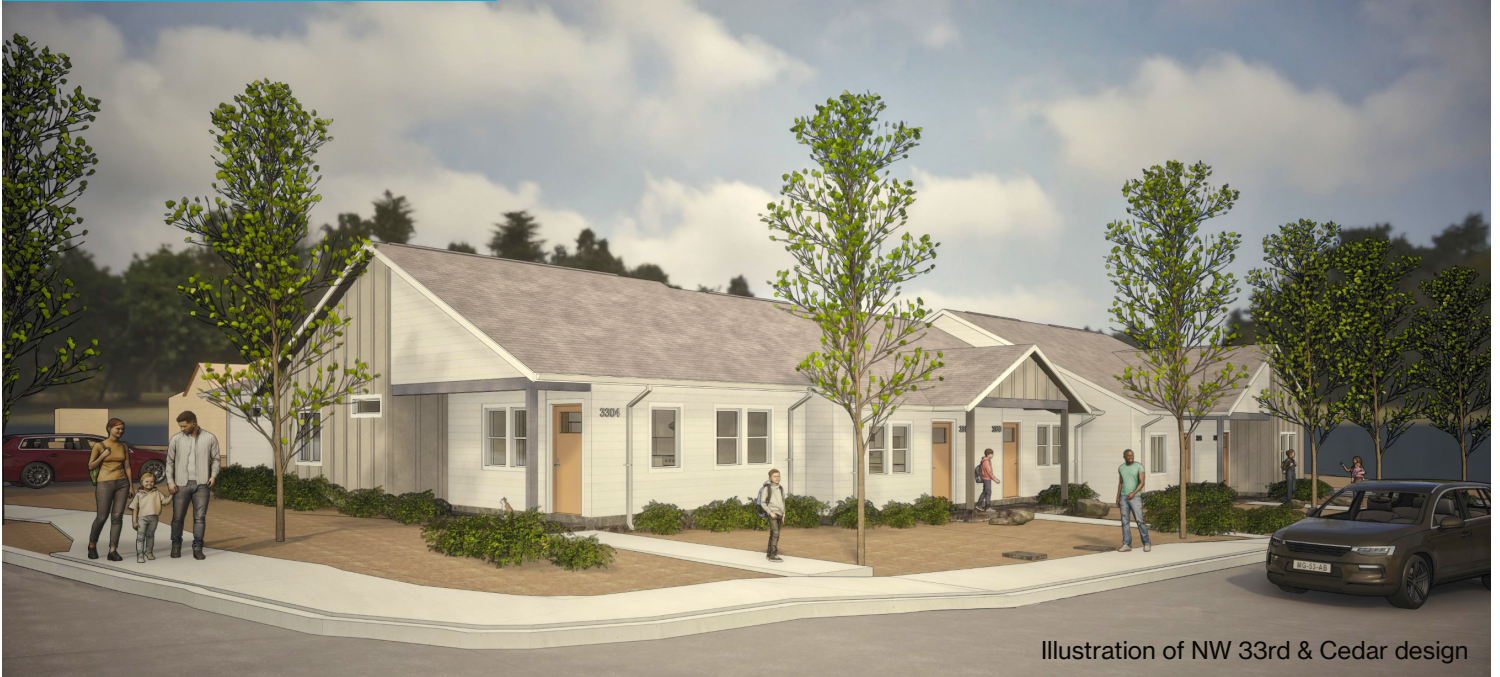
Illustration of NW 33rd & Cedar design